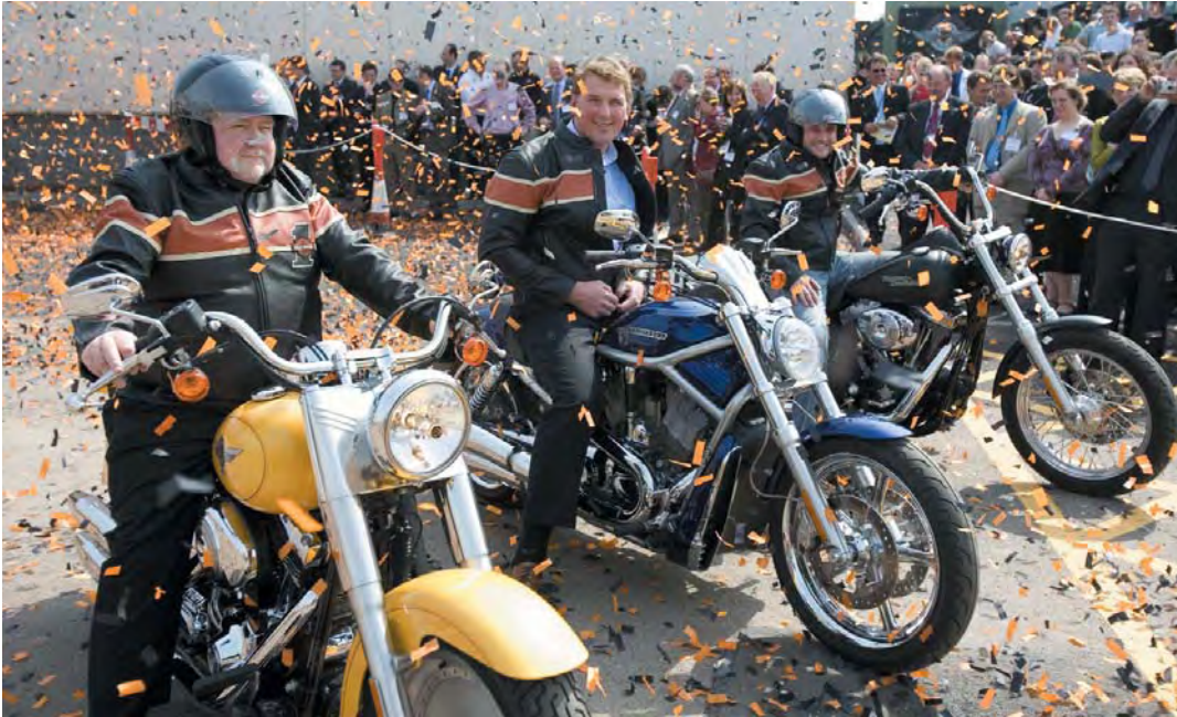
A tickertape welcome for Matthew Pinsent as he arrives on a Harley-Davidson, flanked by outriders.