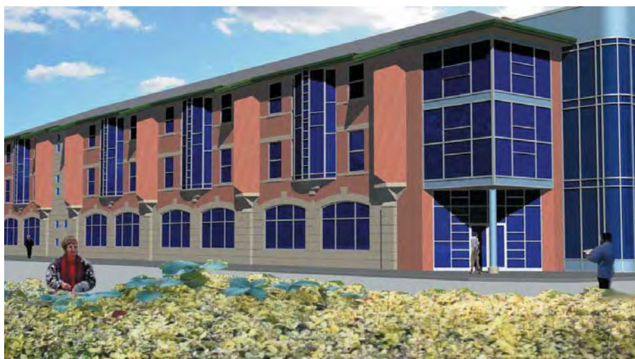
An artist's impression of Burton College's new university centre.

"We shall continue to work hard – to strive ever forward – so that we can continue to provide each of our students with an outstanding education."