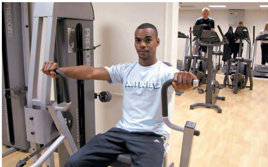
Current sports apprentices work out in Henley College's fitness centre.

The college will be working with eight secondary schools during the first year.